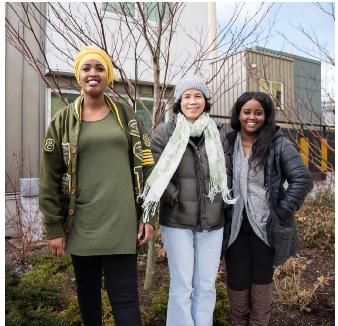
Community Health Workers at Yesler

CHWs provide new Green Clean Toolkits to residents and give presentations at new building openings, community events and annual health fairs. CHWs track how often household members have complained about symptoms of asthma, allergies or other chemical sensitivities.