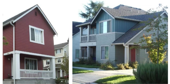
Breathe Easy Homes at High Point

As part of the High Point redevelopment, SHA built 60 Breathe Easy Homes between 2003 and 2007. The homes are scattered throughout the community, located on several blocks and situated in small clusters that also allow for the extension of appropriate design considerations to outside plantings and landscaping. The first occupants of the new Breathe Easy Homes were selected from a pool of original High Point residents with children who suffered from asthma.