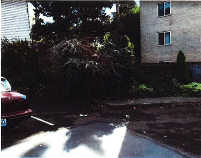
1. Location of fenced enclosure, drive approach and concrete pad