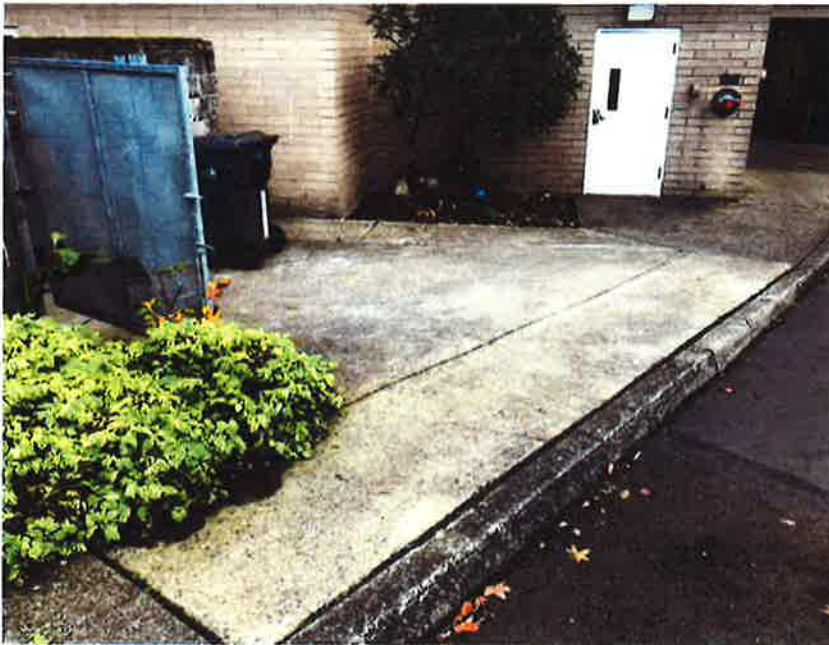
2. Meet point for conduit connection to power outlet and bollard. Will require trench across concrete.