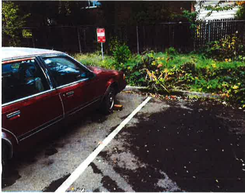
3. Location of powered bollard