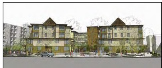
A rendering of the planned 86-unit Lake City Village with Lake City House, a public housing high-rise to the left

In 2010 Seattle Housing finalized the financing package and began construction on the 86-unit rental building. The building will include 51 family rentals designated to serve residents earning 30 percent or less of AMI. These units will increase affordable housing stock in North Seattle, where public housing units are scarce. The remaining 35 units are workforce units serving residents earning 60 percent or less of AMI.