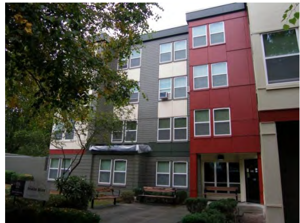
Reunion House, after rehabilitation and resource conservation work was completed in 2010

Seattle Housing continued to work closely with the City of Seattle's Office of Housing on rehabilitation projects by performing energy conservation and weatherization measures. The Office of Housing provided partial funding in the form of energy conservation rebates for items such as new windows, insulation, exterior cladding systems, air sealing, solar hot water systems, and energy saving light fixtures, fans, and elevator motors. Resource conservation work in partnership with the Office of Housing in 2010 included major rehabilitation of three senior housing buildings (Schwabacher, Reunion, and Willis Houses), various special portfolio buildings, scattered sites, and two public housing high-rises (Bell Tower and Denny Terrace). This work will continue at Denny Terrace in 2011.