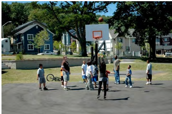
Community members play basketball at Rainier Vista

Phase I: Seattle Housing manages 125 public housing and 59 workforce rental units in Rainier Vista Phase I, completed in 2006. In addition, partners operate 128 additional units of affordable housing on site, including units for seniors and people with disabilities.