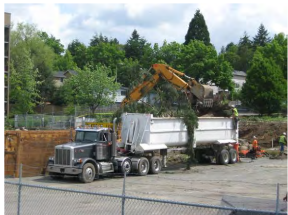
Construction underway at Lake City Village

In 2010 Seattle Housing completed HOPE VI expenditures for both Rainier Vista and High Point. Implementation of the Lake City Village HOPE VI grant was well underway throughout the year and 100 percent of the $10.5 million grant was obligated by year end.