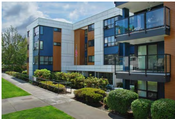
Schwabacher House, renovated in 2010

In 2010 Seattle Housing completed building envelope repairs and window replacement in three buildings (Schwabacher House, Willis House, and Reunion House). Seattle Housing was awarded $3 million in matching funds from the City's housing levy in 2010 to conduct major water intrusion repair work and window replacement at Nelson Manor and Olmsted Manor, as well as repair and prevention work at Blakely Manor and Bitter Lake Manor. This work will begin in 2011.