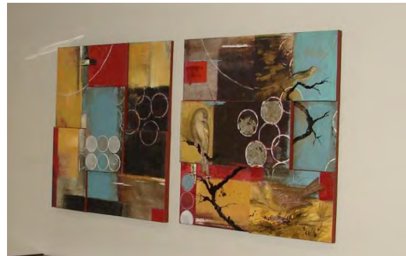
Local artist's work at Tamarack Place

Prior Year Capital Sources were made available through Tamarack's mixed finance close in 2009. The community is complete and fully leased. Final pay-outs are expected to occur in 2011.